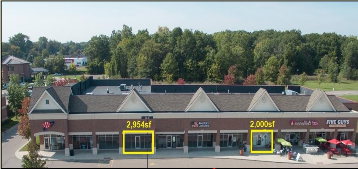
Location - Retail E